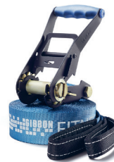
RATCHET + LINE